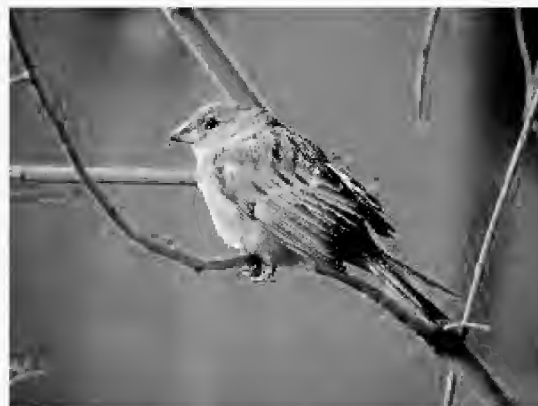
House Sparrow female

The Bombay Natural History Society (BNHS) has launched an online survey inviting inputs from common people to document the decline in population and distribution of House Sparrow Passer domesticus all over the country. The project called Citizen Sparrow is supported by a number of nature and conservation organisations across India. Although it is among the most widely distributed birds in the world, the number of sparrows has dropped sharply in many places in the last several decades. In the survey, anyone with past or present information about the bird is encouraged to participate. In addition, it allows people to share their stories and observations about these birds. Participants can mark locations on a map and give simple information about their sparrow sightings from those locations, including sightings from past years and decades. With such information it is possible to compare population changes of sparrows in different places, and this is expected to point to particular threats or problems. Findings from the project are intended to feed into more detailed studies investigating causes of decline, and potential measures for the recovery of sparrow populations. All information collected through the two-month long survey (1 April - 31 May 2012) will remain in the public domain for anyone to access and use. To participate in this research, people have to log on to www.citizensparrow.in and enter the details asked for.